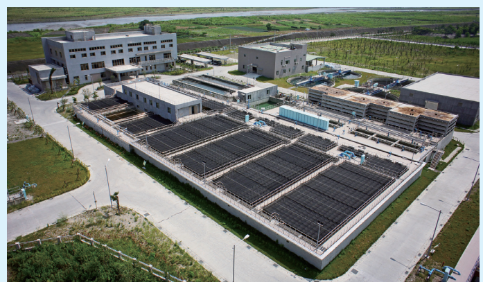
Chinchu Water Treatment Plant (WTP) EPC Project