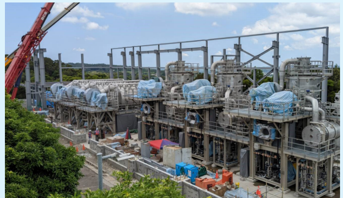
Tongluo Science Park Wastewater Treatment Plant Phase II Project - "Functional Improvement of Conductivity Treatment Facilities" Turnkey project