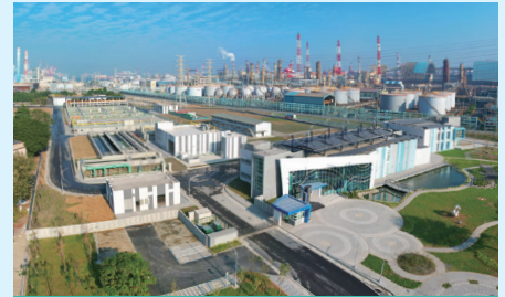
Kaohsiung Linhai Wastewater Treatment Plant and Reclaimed Water BTO Project