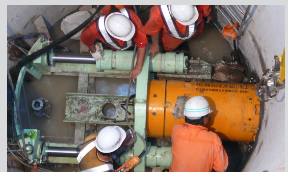
New Taipei City Tamsui Area Public Sewerage System Piping Project