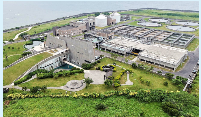
New Taipei City Tamsui Area Sewerage System BOT Project