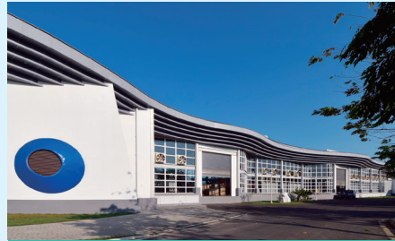
Kaohsiung Fengshan River Wastewater Reclamation Plant BTO Project